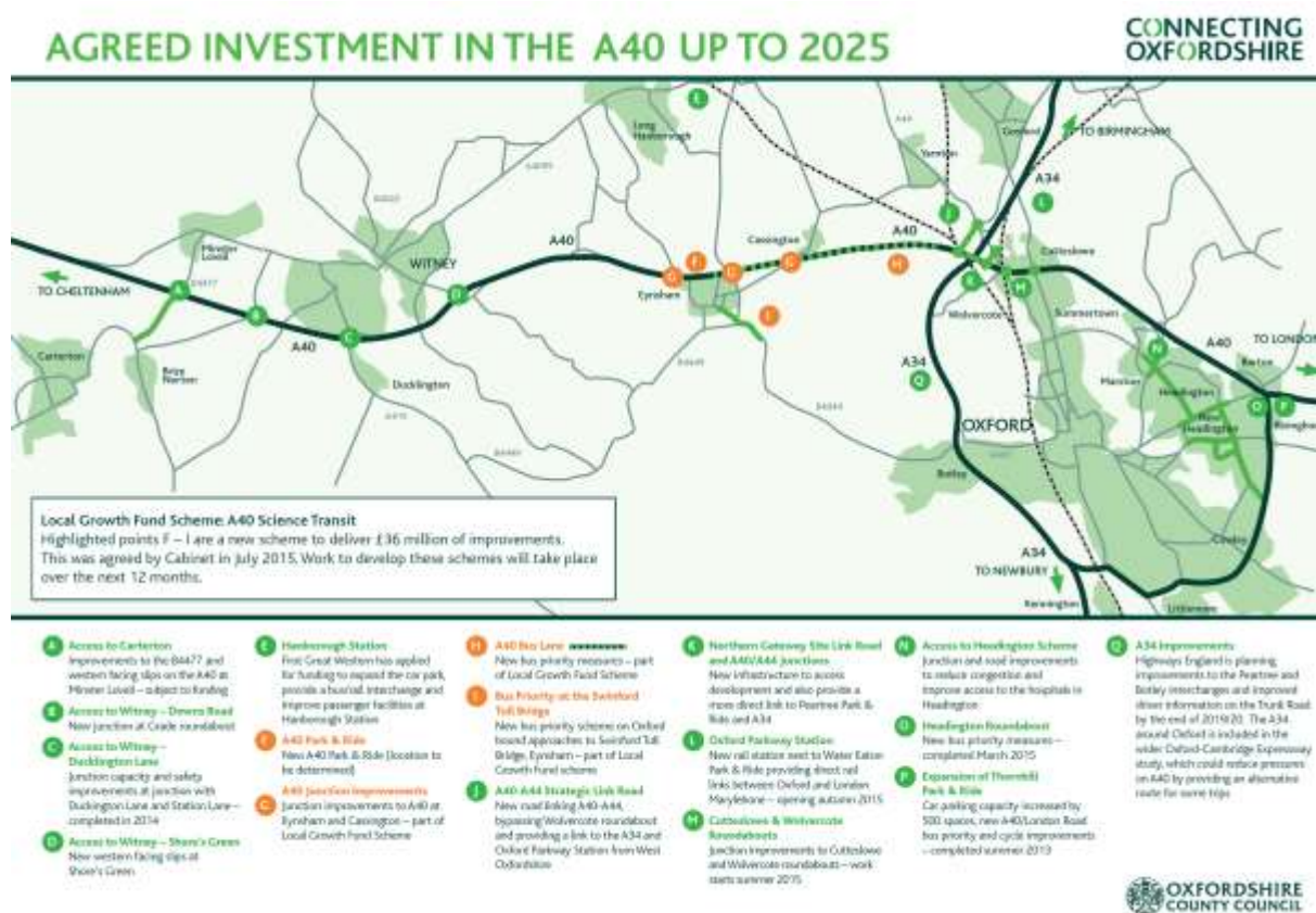
Figure 1: A40 Science Transit 2 Map